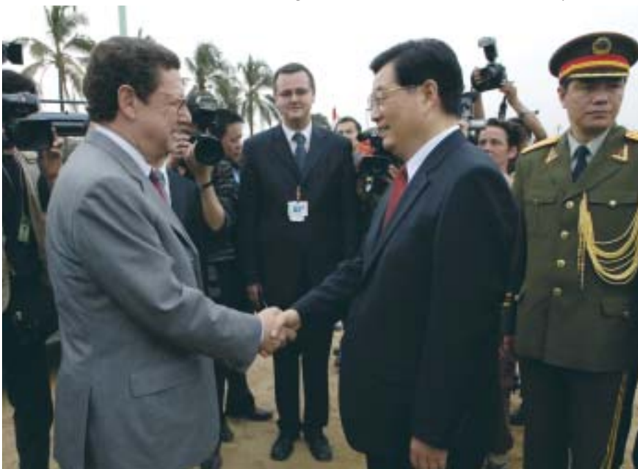
■ Welcoming His Excellency the President of the People's Republic of China on his visit to Chinese troops in Liberia (Liberia 2007)