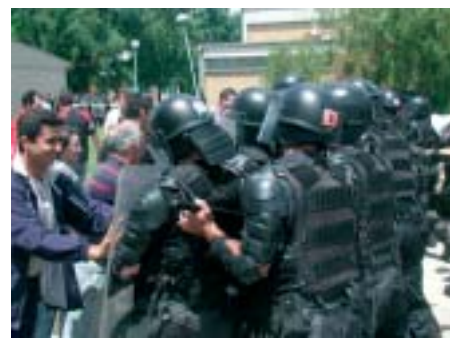
■ Riot control

This is a lifetime opportunity that very few police officers actually get the honour and privilege to enjoy. We can introduce a lasting legacy of change in another country.