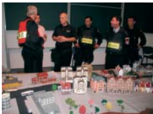
■ Emergency operations training

Overall, I think the police see themselves as serving their country and fellow citizens. Every police officer faces a situation at some time or another in which they have to decide whether or not they will do the right thing, or if they will make excuses for accepting a bribe, looking away when someone they know clearly breaks the law. It doesn't help that police salaries are very low, or when their agency fails to pay them on time. When a police agency fails to take care of their officers, their failure creates a situation where corruption can grow. I also believe that every organization reflects the attitude and character of its leaders. When you find a leader who is very verbal about corruption, and who establishes through his actions that he is above corruption, you will generally find an organization with very little corruption. Hence, the only way to solve the problem is to start at the top and insure that every supervisor, at every