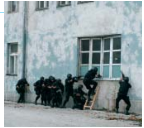
in Banja Luka, Mostar, Sarajevo and Tuzla).

We still lack staff and equipment. According to the Book of Rules, our department should consist of 36 investigators. There are only 26 of them. We have recently submitted a proposal to the Ministry of Security and the Council of Ministers to increase our staff to 47 investigators at the War Crimes Investigations Centre itself and 12 investigators in each of our four regional offices (respectively