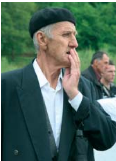
■ Old man walking in between the graves at the Srebrenica commemoration on 11 July 2007

Solving war crimes should be regarded as a priority for this country. Full reconciliation cannot be achieved without war criminals being sanctioned.