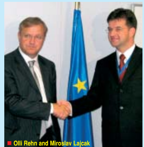
■ Olli Rehn and Miroslav Lajcak

● The signature of a Stability and Association Agreement (SAA), the first step towards EU integration, cannot be imposed on a country. It is up to the country's free will to join the EU. Police reform is one of the main pre-requisites for the signature of such an agreement and using the Bonn powers to impose police reform would equal to imposing EU integration on a country. ■