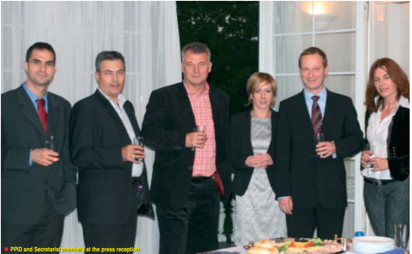
■ PPID and Secretariat members at the press reception

Established two years ago by the EUPM PPID, the so called Secretariat of the BiH Police Spokesperson's Forum has a very demanding task to perform - to 'translate' and present police activities in a format understandable for the ordinary citizens.