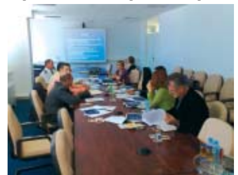
■ Secretariat discusses Organised Crime campaign